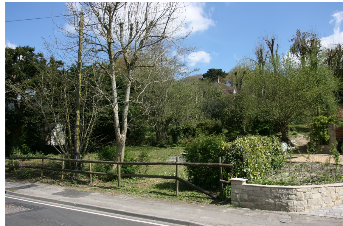
View of site for proposed cottage – Reads Cottage is to left and Orchard House is above and behind

Hirondelle, Swallowcliffe, Salisbury, Wiltshire, SP3 5NX. Tel: (01747) 870854 david.gregory.architects@googlemail.com www.davidgregoryarchitects.co.uk