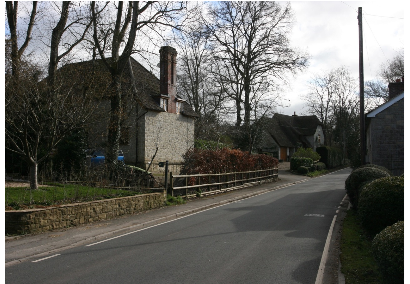
The Birches – presenting a prominent chimney and high roof behind

This four-bedroom house has a prominent chimney, but otherwise a rather defensive stone wall facing the street, behind which a steep hipped roof rises to a ridge with recorded height of 97.81m.