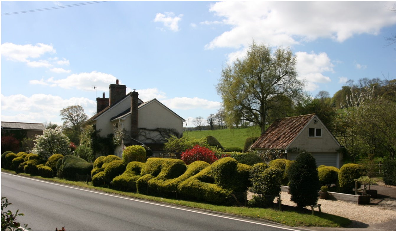
View to south west from Reads Cottage front garden and veranda

Reads Cottage has four bedrooms and is set close to the street with frontage width of 16m, along which is the distinctive south-west facing veranda that enjoys the afternoon sun and views across the street to the valley beyond.