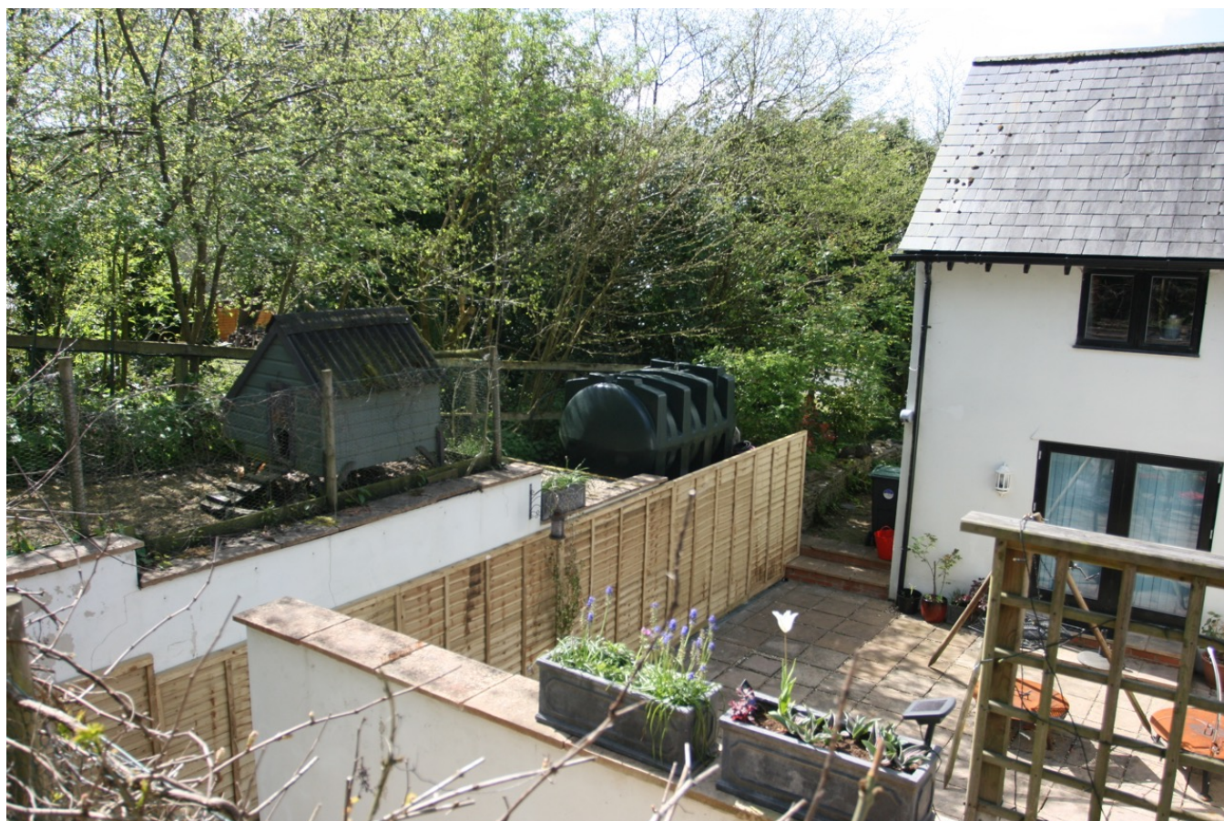
View from upper garden terrace of Reads Cottage looking south west

An observer looking due south from the observation point at Reads Cottage French window will see a retaining wall currently, with oil tank in foreground before the boundary fence.