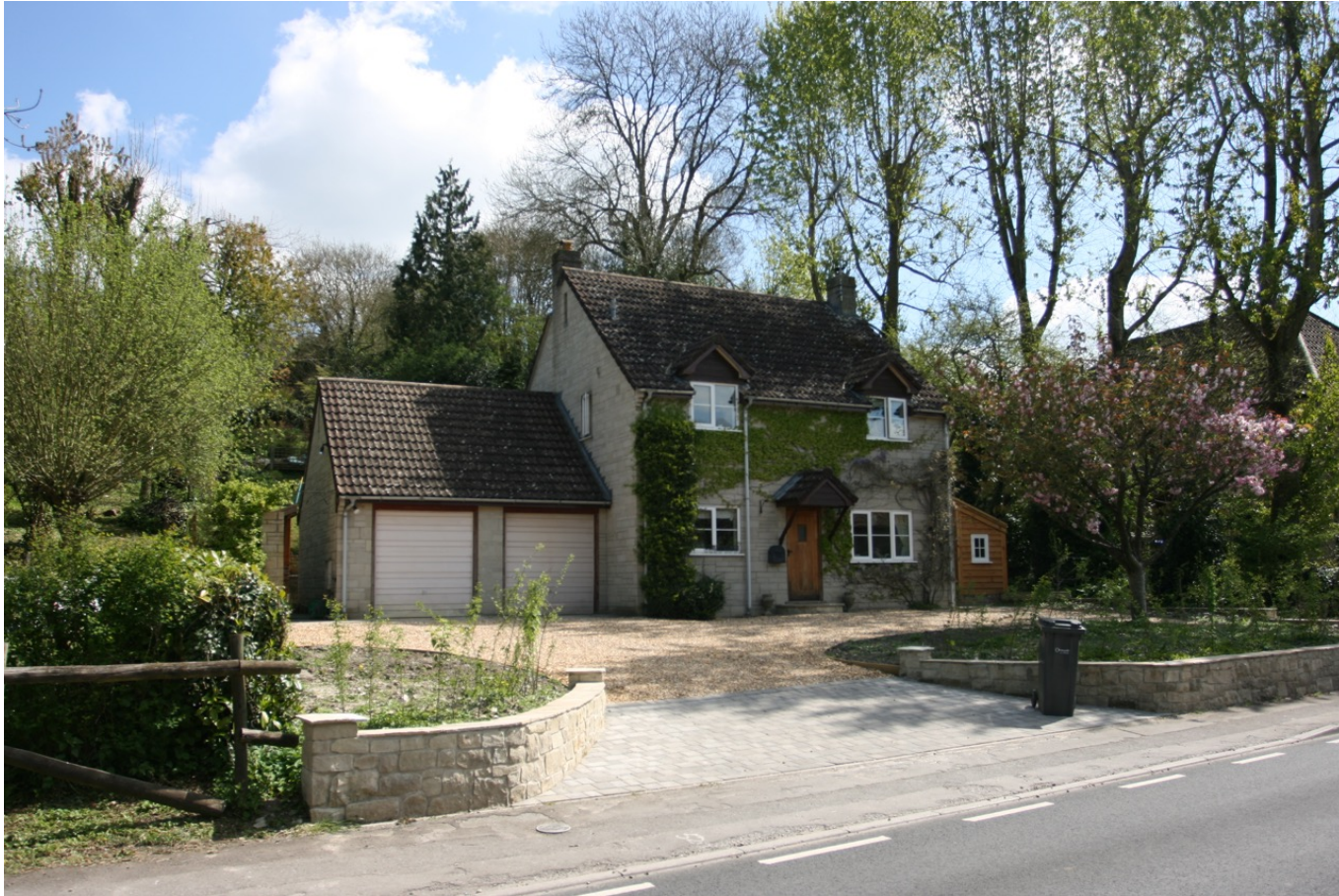
Corrindale, with recent entrance walls – the ridge of proposed cottage sits 8 inches above Corrindale's ridge

Corrindale's frontage is 13.7m including the garage, with gables set close to the plot boundaries to either side.