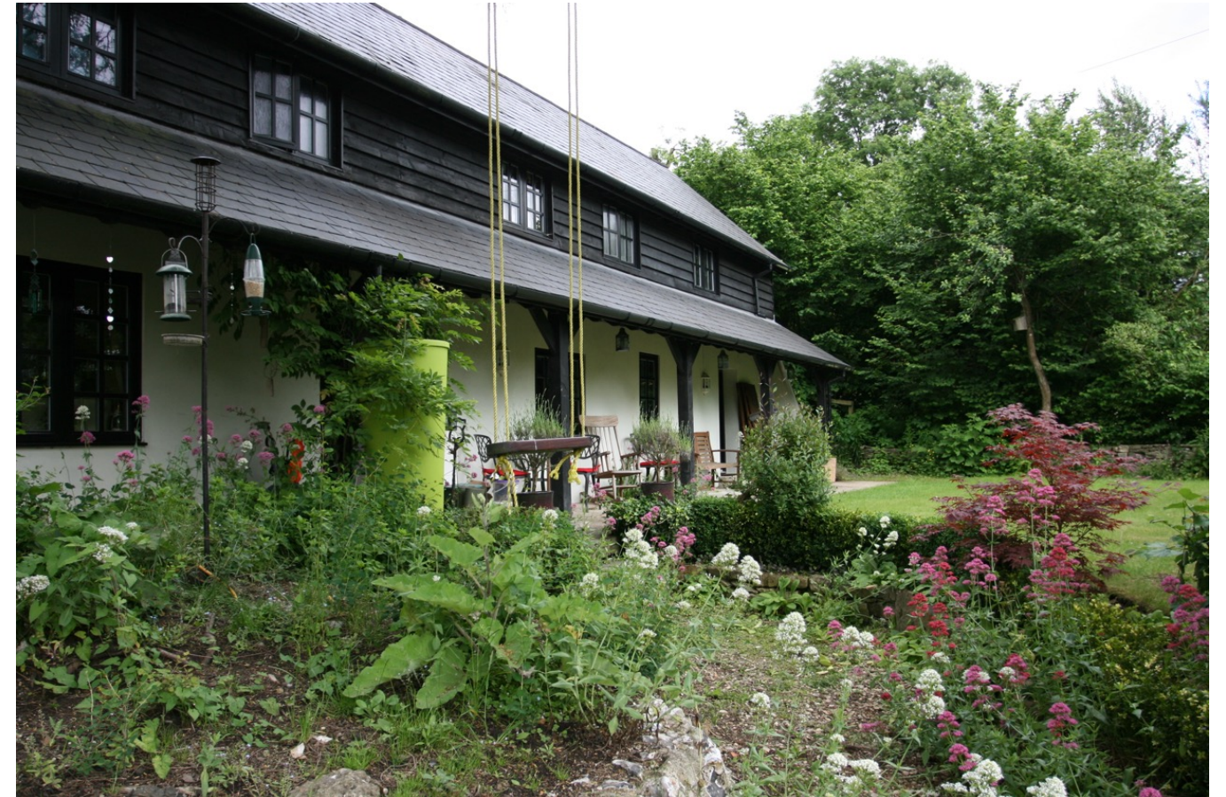
The sunny afternoon veranda to Reads Cottage – proposed cottage will be beyond hazel hedge

The cottage has a ridge height of 94.39m and a ground floor level recorded at 88.00m, which allows the entrance and veranda to be at 1.3m above pavement level.