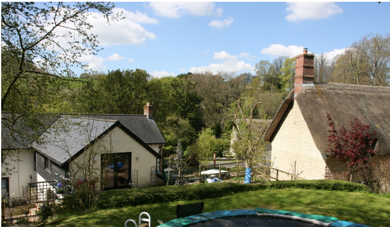
View from upper lawn of Reads Cottage garden with the higher Brook House to right

To the rear is a bedroom and living room, with the first floor opening out onto the retained rising valley side, and then garden and deck spaces stepping up the slope.